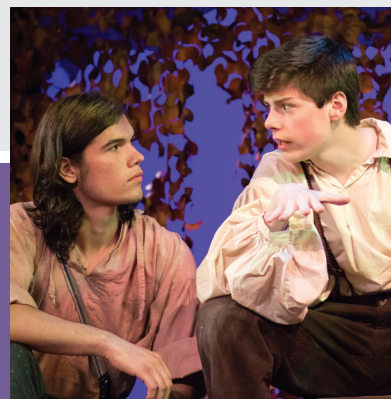
Scenes from CCTC/HJT productions of Beauty and the Beast , The Emperor's New Clothes , and The Adventures of Tom Sawyer