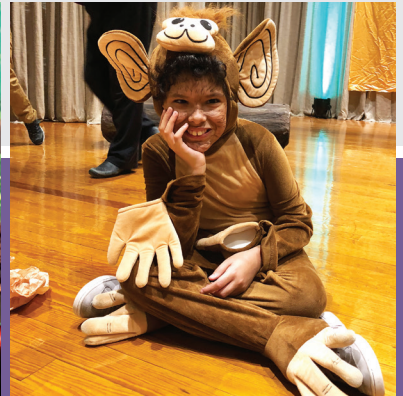
Scenes from The Technichoir at Cape Tech High School, The Bluebird of Happiness at Monomoy Middle School, and The Jungle Book at Wixon Elementary School