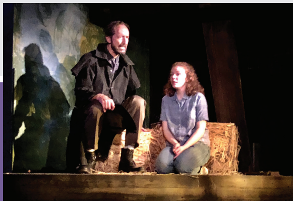
Scene from world premiere of Wolf Hollow